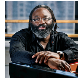
Awadagin Pratt, piano