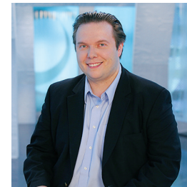
Ignat Solzhenitsyn, piano